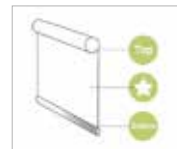
Preferred Stop Position